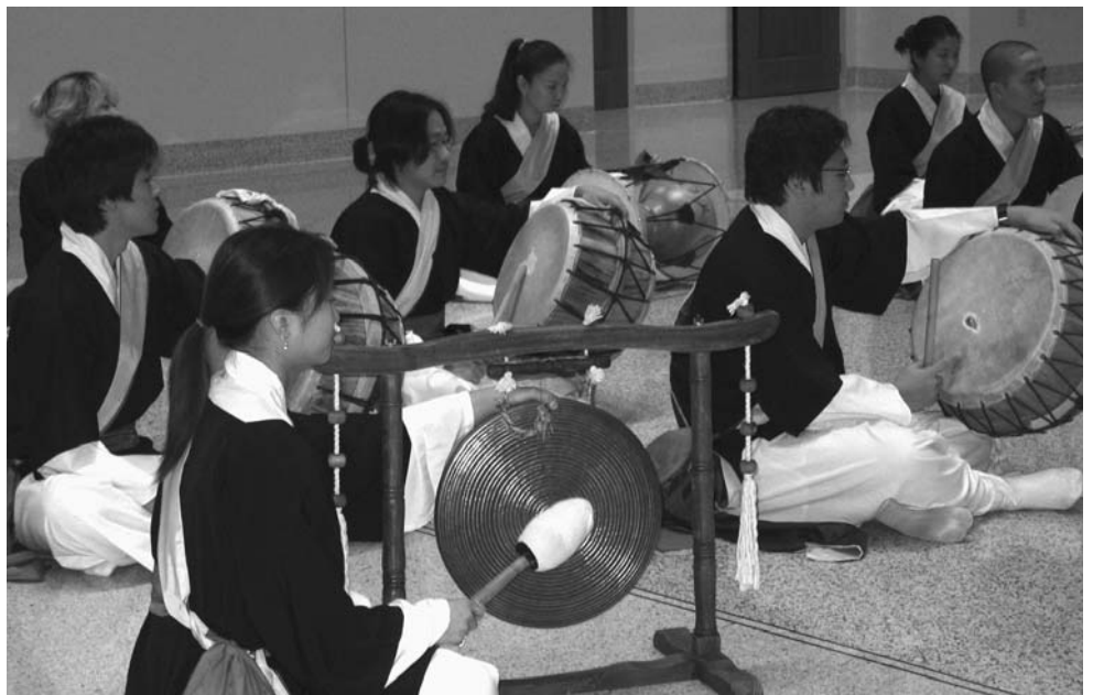
Korean Traditional Drumming Group, a student club that performed during "A World of Opportunities" day at the Memorial Union, as part of International Opportunities Month in February 2005.