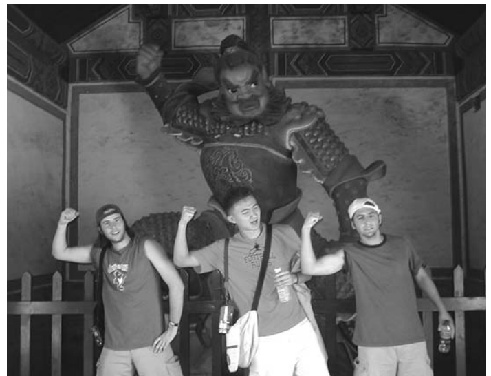
Study abroad students visit Bei Dai He, China.